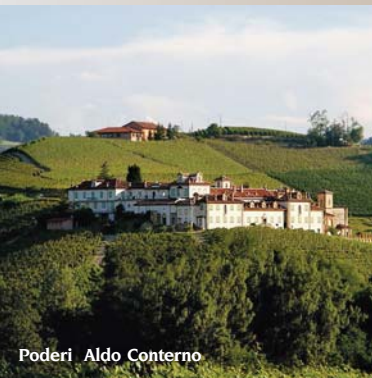
Poderi Aldo Conterno