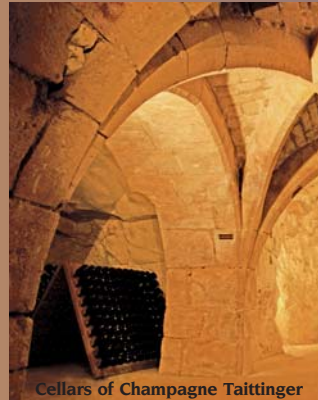
Cellars of Champagne Taittinger

Dominus 'Estate' (RP95) Insignia, Joseph Phelps Vineyards (RP95) Legacy, Stonestreet Estate Vineyards (RP93) Monte Bello, Ridge Vineyards (RP95) Shafer 'Hillside Select' (RP93)