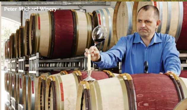
Peter Michael Winery