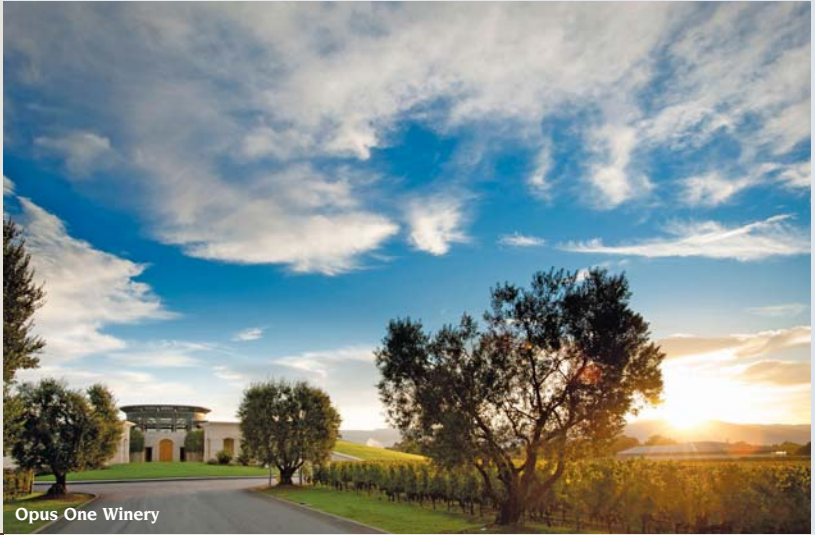
Opus One Winery