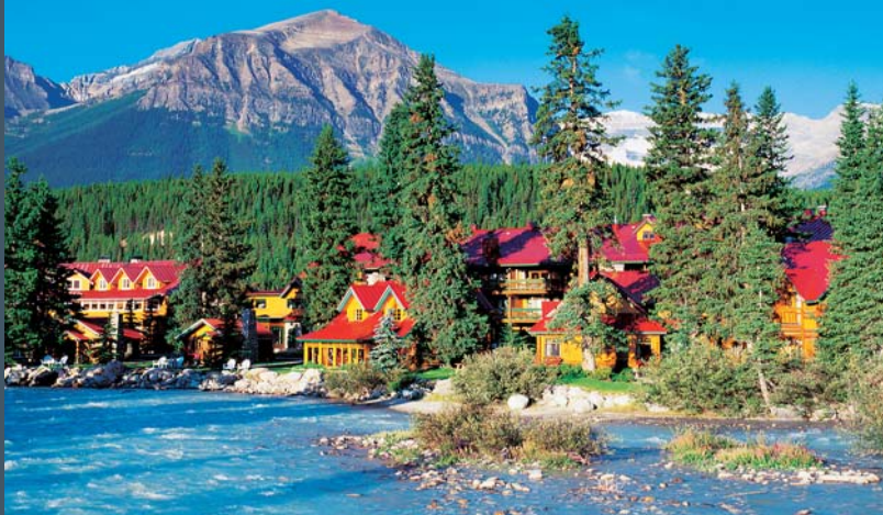
Pipestone River view and The Post Hotel & Spa