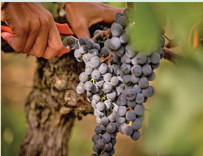
Paul Jaboulet Aîné